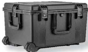
HD Transit Hard Case