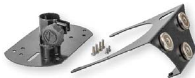
Universal Tripod Mount Magnetic Mount

Designed for both Android and Apple devices, the HyperSpike® Mobile App puts everything an operator needs in the palm of their hand. Whether you are hard-wired to the device (with the supplied headphone jack) or connected via an optional Bluetooth receiver, the Mobile App provides the standoff capability operators need.