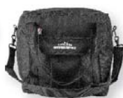
Soft Cover Carrying Case